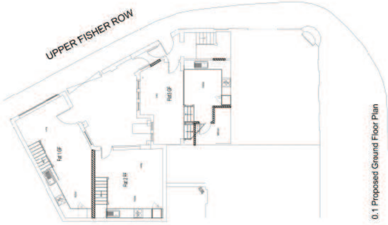
0.1 Proposed Ground Floor Plan