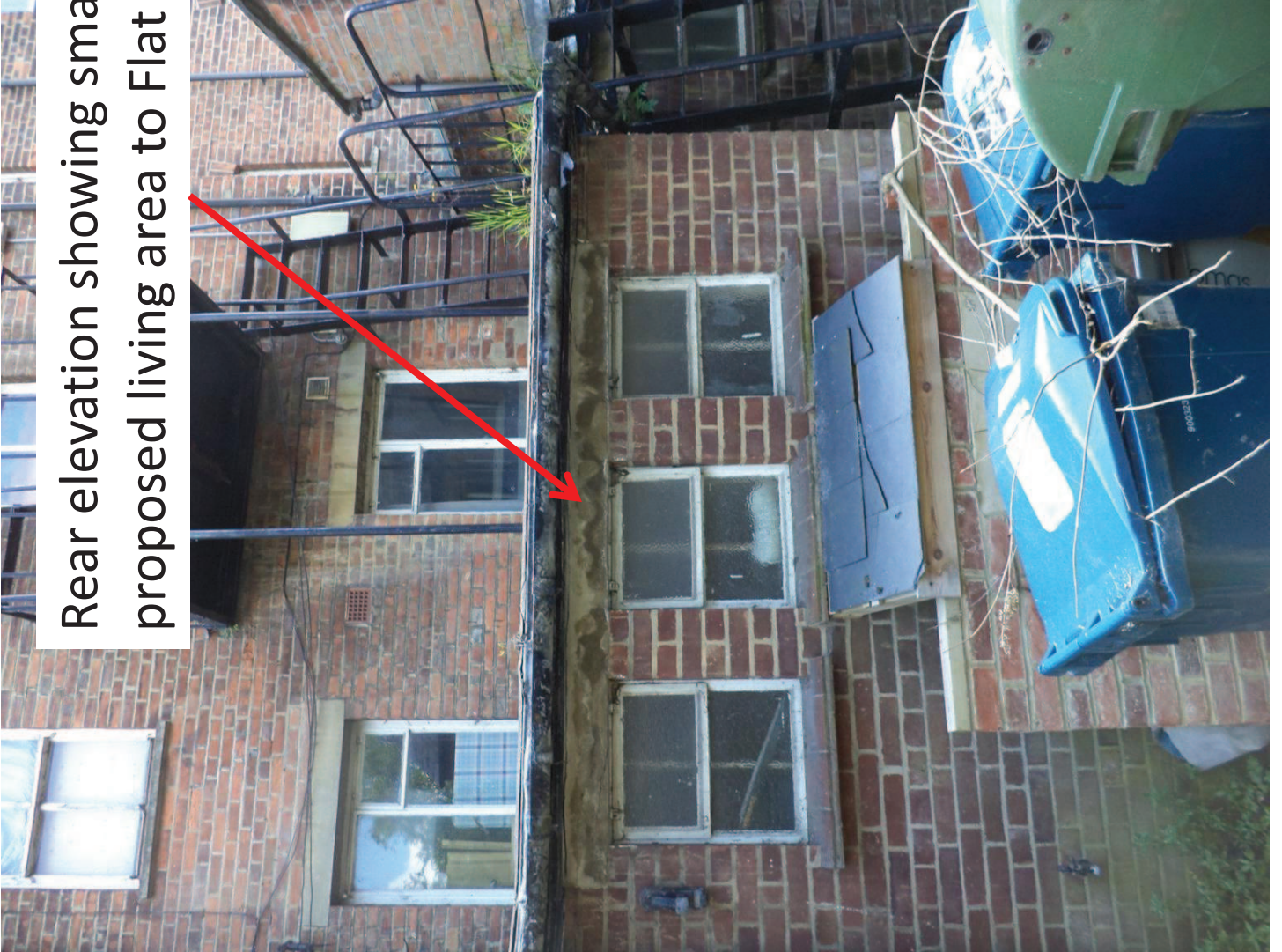
Rear elevation showing small windows to proposed living area to Flat 3