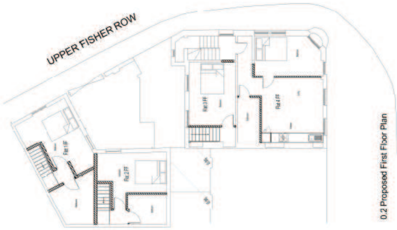
0.2 Proposed First Floor Plan