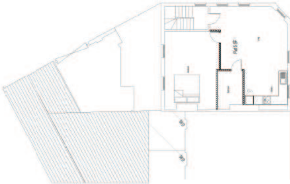
0.1 Proposed Second Floor Plan